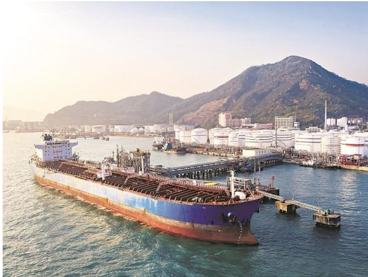
Revenue from bulk carrier, liner, and technical and offshoot segments came in at Rs 101.41 crore, Rs 134.96 crore, and 46.49 crore, respectively.