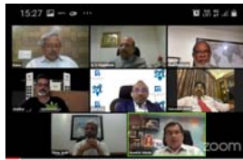
FIATA and FFAI assert global recognition to Freight Forwarding as essential services ... Page 3