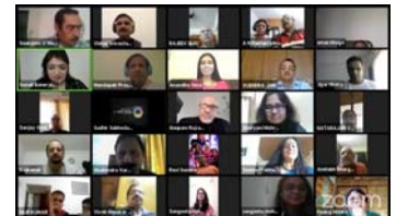
Antakshri – Sur Milae Sabbka was organized by IME(I) ... Page 4